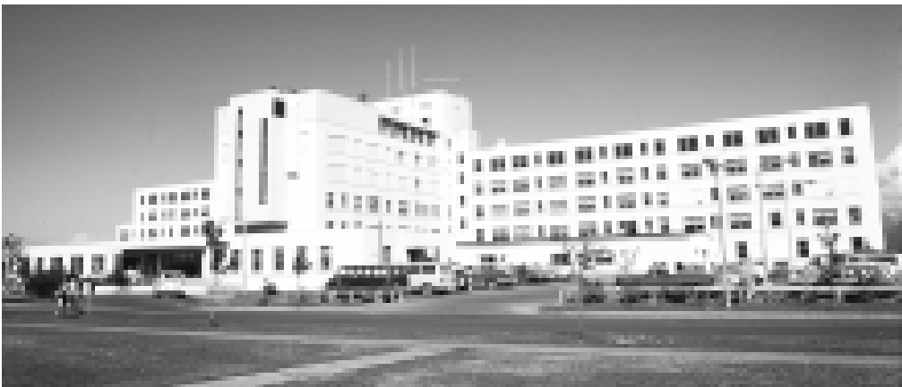
The new Alaska Native Medical Center, located in Anchorage’s U-Med district near the UAA and APU campuses, was built in 2000 (top photo). It replaced the old hospital that formerly existed just east of downtown Anchorage (bottom photo).