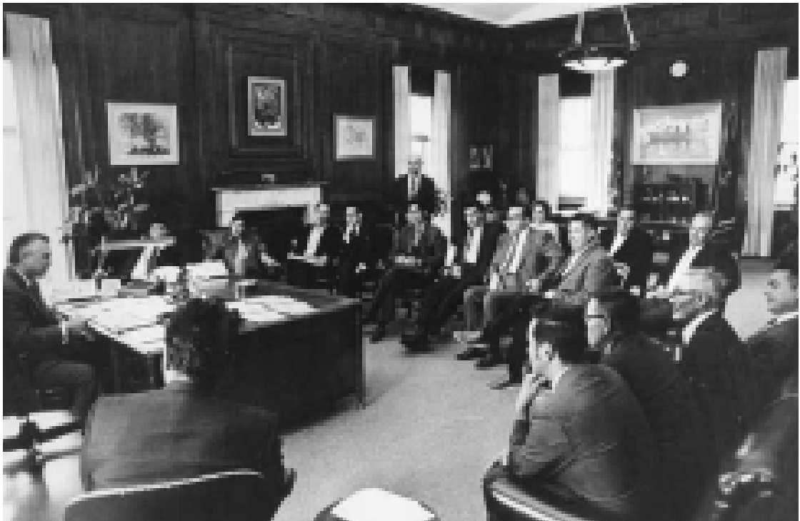
Alaska State Library Photograph Collection, ASL-P01-4686

Until ANCSA, official U.S. policy had been to “grant to them (indigenous people) title to a portion of the lands which they occupied, to extinguish the aboriginal title to the remainder of the lands by placing such lands in the public domain, and to pay the fair value of the titles extinguished.” 3 (This policy was frequently dishonored, however; a cursory review of Native American history indicates numerous incidences of indigenous groups being forcibly removed from their homelands without remuneration).