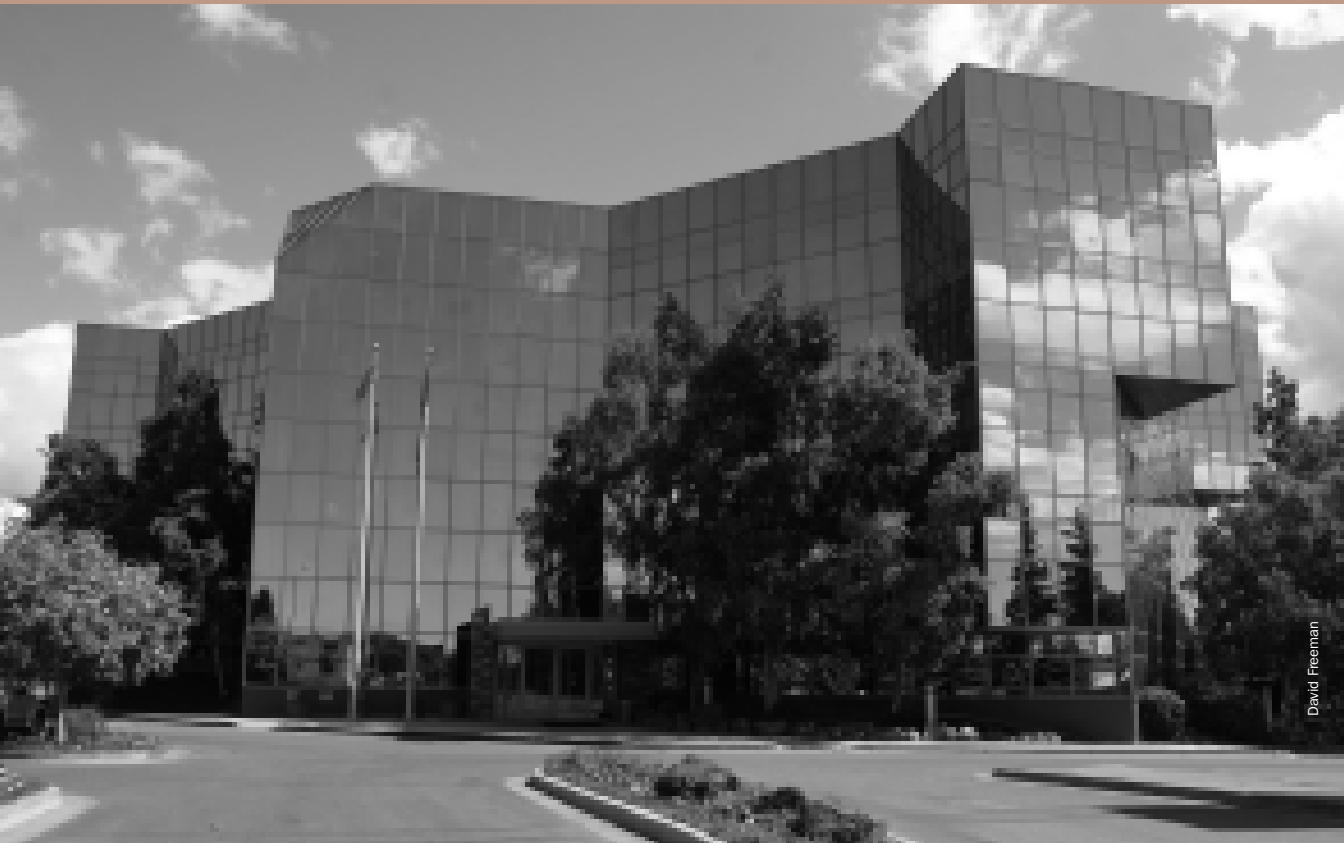
Cook Inlet Region Incorporated (CIRI) headquarters, Anchorage, Alaska.